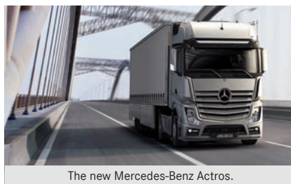
The new Mercedes-Benz Actros.

Factors behind the engine’s outstanding economy include its exceptional robustness and longevity as well as maintenance intervals of up to 150,000 kilometers. Maintenance and repair costs have now been further reduced, so that the new Actros has