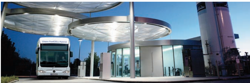
The fuel cell represents a major advance in the mobility of electrically powered vehicles, with locally emission-free operation, a long range, and short filling times – in passenger cars and commercial vehicles.

Fuel cell vehicles have already demonstrated their suitability for everyday use. To successfully establish this locally zero-emission drive technology on the market, a close-knit supply of hydrogen must be secured.