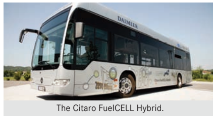
The Citaro FuelCELL Hybrid.

vehicles each covered more than 30,000 kilometers without encountering problems. Daimler sees this as sufficient reason to launch the B-Class F-CELL on the market as the first series-produced electric vehicle powered by fuel cells. Series manufacture of the next fuel cell vehicles is now expected to commence as early as 2014, rather than in 2015 as originally planned.