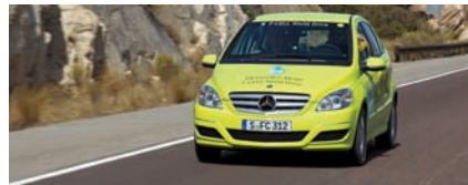
The B-Class F-CELL on the F-CELL World Drive.

Daimler has already proven the everyday practicality of fuel cell drive. Mercedes-Benz demonstrated the qualities of its fuel cell automobiles in terms of driving performance and robustness on the “F-CELL World Drive,” in the course of which three B-Class F-CELL